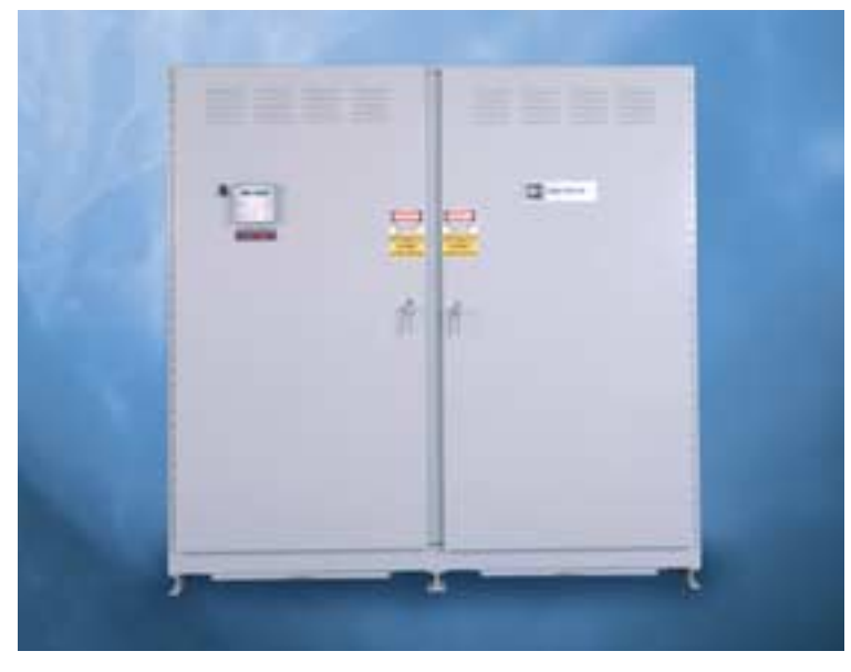
Cutler-Hammer Low Voltage Switched Capacitors

factor improvement. In the presence of harmonics, where harmonic resonance is of concern, engineers have successfully applied single and multiple series-tuned capacitor/filter banks with good results. However, where systems employ a number of operating configurations, and where future harmonic-producing loads are anticipated, this traditional approach often fails.