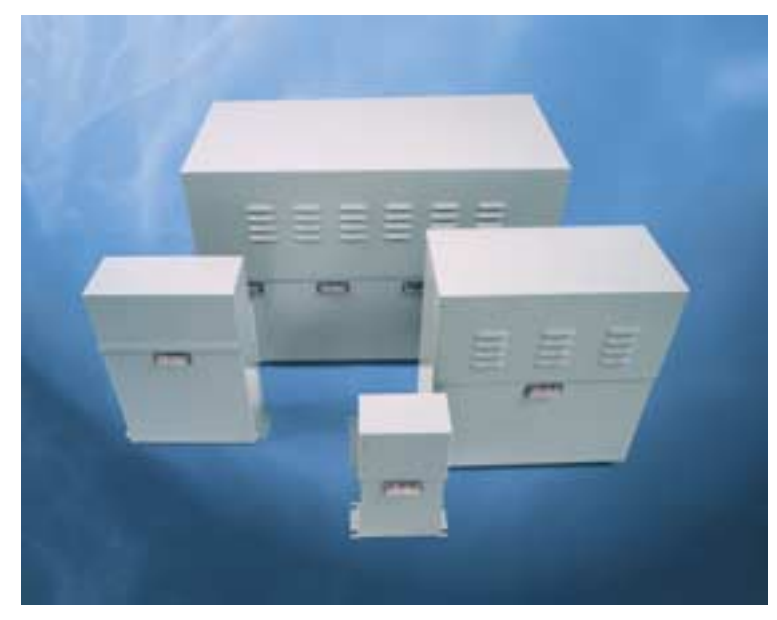
Cutler-Hammer Low Voltage Fixed Capacitors

Approximately two years ago, a privately owned, medium-sized petrochemical company realized they were